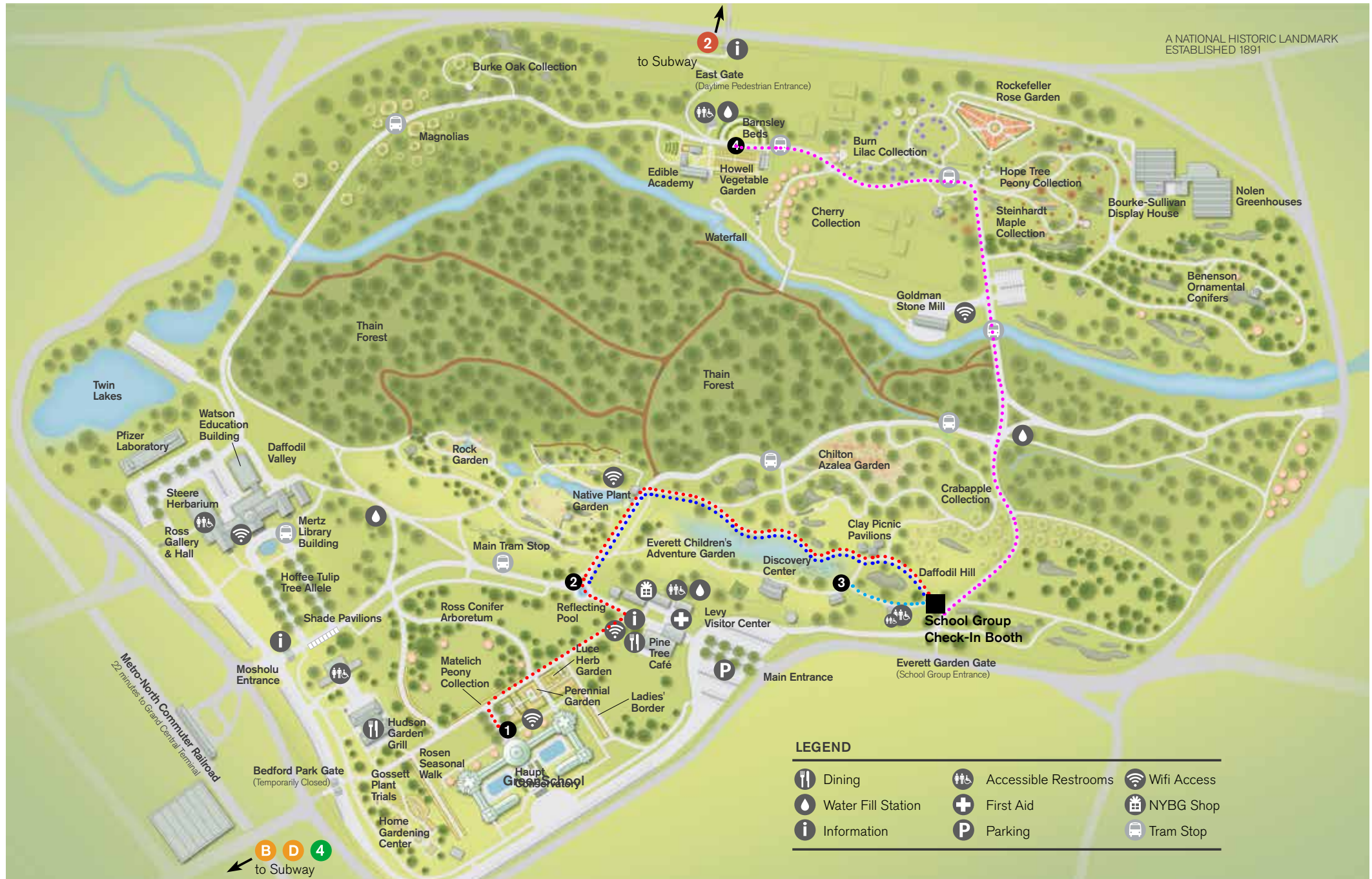
NYBG School Group Map

Lunch at Clay Family Picnic Pavilions: All school groups must bring lunches. School groups are invited to eat in the outdoor Clay Family Picnic Pavilions located near the Everett Garden Gate. There are no indoor lunch facilities.